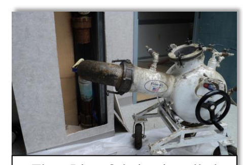
Flow-Liner® being installed

"Your product saved us from costly excavation under the main building slab...we highly recommend your pipe liner and consider it a valuable option. We will look to you in the future should we face similar circumstances."