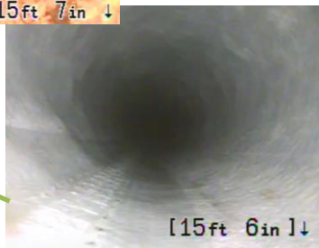
After CIPP Flow-Liner®