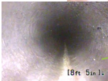
After FLIP™ Treatment