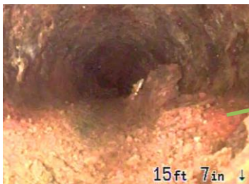
Before CIPP Flow-Liner®

Genesis HealthCare System is an integrated health care delivery system based in Zanesville, Ohio. The system currently operates at two Zanesville sites, Genesis-Bethesda and Genesis- Good Samaritan. Bethesda Hospital, originally known as Zanesville City Hospital, was started in 1891 as a 12- bed hospital. Today, Genesis is the largest health care provider in its six-county region of southeastern Ohio. In May 2013, a groundbreaking was held at the Bethesda Hospital campus to begin expansion for a new state-of-the-art facility that will house all services on one campus location. The grand opening of the newly expanded Genesis HealthCare System is expected to be completed in 2015.