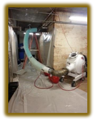
Flow-Liner® Equipment Set-up