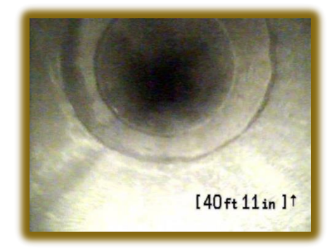
Condition of 8 inch roof drain before lining

"We would highly recommend your product and consider it a very viable option compared to pipe replacement. I was really impressed with the strength of your product."