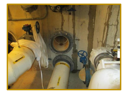
Access to 12" ID Pipe in the Pump Room

"We are very happy with the Flow-Liner installer and pleased that we didn't have to dig up and replace the leaking pipe."