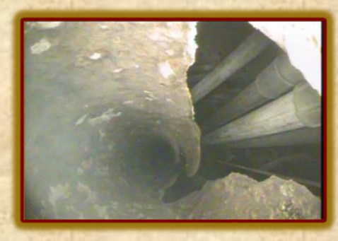
Deteriorated Cast iron pipe prior to lining

"I would like to thank everyone at Flow-Liner who worked with us to successfully complete our pipe lining project. The team was professional, polite, and totally committed to making this solution work."