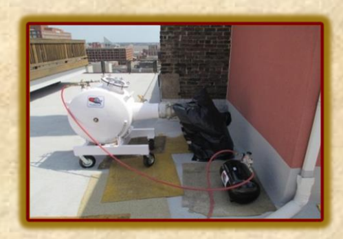
Flow-Liner® Equipment Set-up