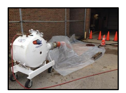
Flow-Liner® Equipment Set-up

The facility had 3", 4", 5" and 6" cast iron main sanitary sewer pipes throughout the facility that were in need of cleaning and repair. Being a Correctional Facility operating at capacity 7 days a week/24 hours a day, replacement was not an option.