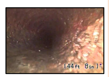
Cast Iron before cleaning