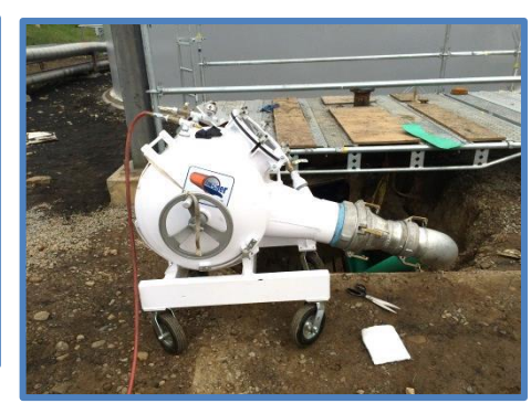
Flow-Liner® Inversion System

ERGON, Inc. had an underground 6 inch ID steel pipe at their waste water treatment facility that was in need of repair. Excavation was undesirable due to the pipe running under a concrete processing tank.